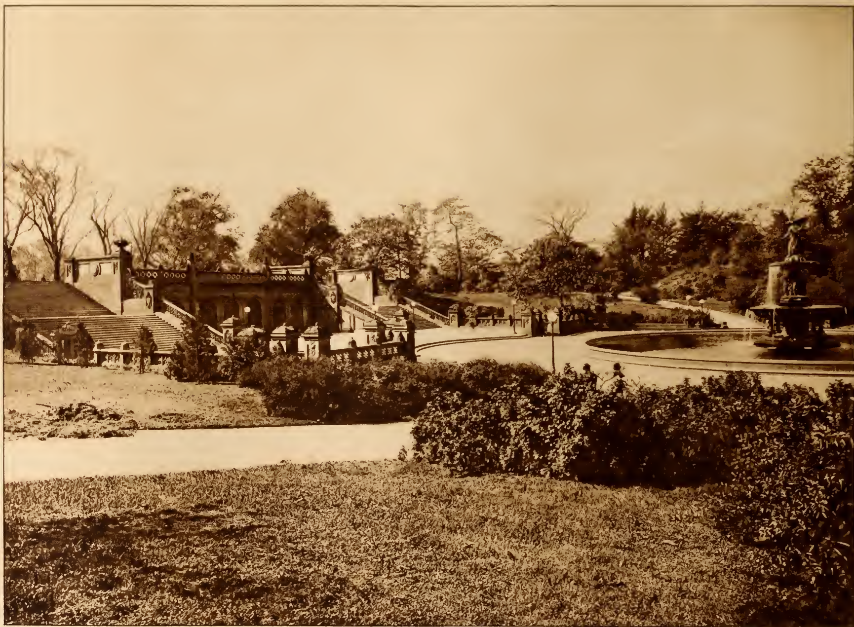
TERRACES, CENTRAL PARK, overlooking Bethesda Fountain and the Lake. One of the prettiest spots in the park and a splendid example of landscape gardening. Surmounting the fountain in the center of the pond is a graceful statue representing the angel blessing the water of the pool of Bethesda. The stairway is of limestone carved in birds, fruits and flowers.